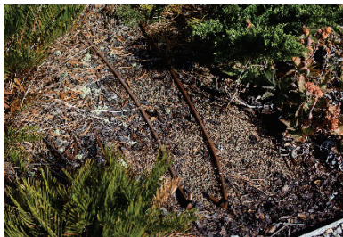
4,9 Exposed, Replant