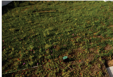
18,19 Planting quality