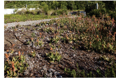
18 Plant health