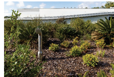
19 Plant density