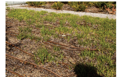
4,9 Exposed, replant