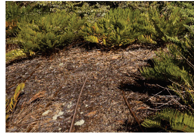
9,11 Replant, stressed